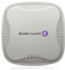
OmniAccess IAP103 IEEE 802.11a/b/g/n Wi-Fi

Using a single infrastructure for wireless (Wi-Fi) access is cost efficient.