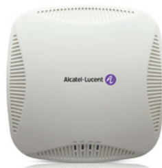
OmniAccess IAP205 IEEE 802.11a/b/g/n/ac Wi-Fi

Dual radio (MIMO) with IEEE 802.3af Power over Ethernet (PoE)